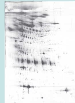
CSF with abundant protein depletion